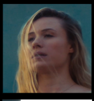
SARA MEARNS @saramearns MEARNS IS AN INTERNATIONALLY RENOWNED CLASSICAL BALLERINA, AND PRINCIPAL DANCER WITH THE NEW YORK CITY BALLET