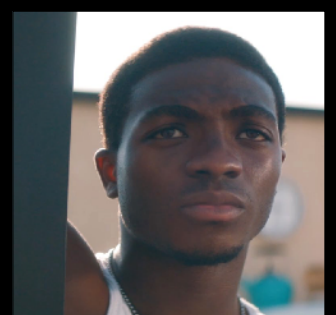
DHARON JONES @dharonejones JONES IS AN AMERICAN ACTOR, RECENTLY ORIGINATING THE ROLE OF RIFF IN THE CURRENT 2020 BROADWAY REVIVAL OF WEST SIDE SIDE STORY